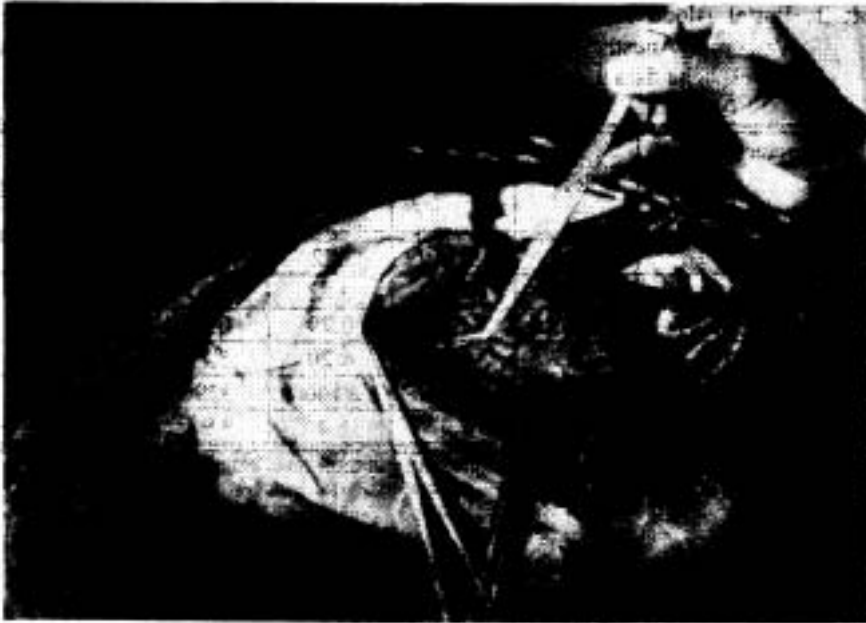
Fig. 2. Position of the Right Ruminal Vein where the Infusion Cannula is Placed for Portal Blood Flow Measurement by the PAH-Method