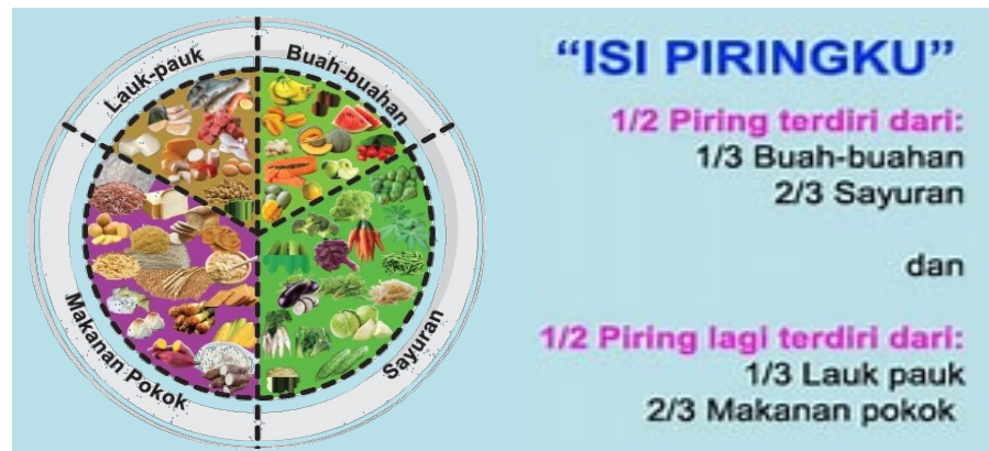
Figure 1. Balanced nutritional composition in the contents of my plate (Kemenkes Website, 2020)

which will be delivered to the community to discuss food and nutrition problems that occur in the working area of the Pidie District Health Office.