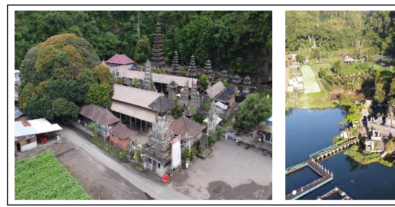
Figure 2. Ulundanu Batur Songan Temple and Tirta Pancoran Solas in Kintamani agro-ecotourism

This study uses quantitative and qualitative approaches. Purposive sampling of 100 visits was employed to estimate the sample size, following the variant-based structural equation model (SEM) or partial least squares (PLS), which suggests 30 to 100 respondents. Convenience sampling determined the number of visitors at the research site. This study was conducted from April to October 2022 at Kintamani Bali Agro-ecotourism. Visitors' perceptions of agro-ecotourism attributes, services, CHSE program implementation, satisfaction, and loyalty in Kintamani were collected as the primary data.