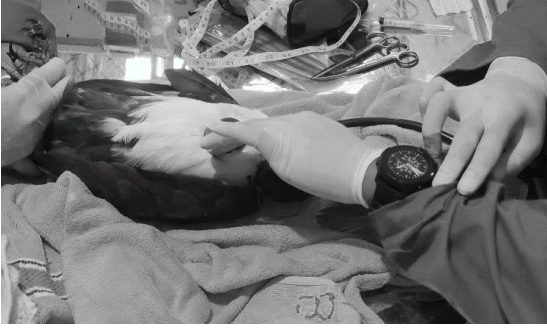
Figure 2 Data Collecting Proccess

rehabilitation at the same facility. The information gathered is based on the PKEK's routine and scheduled health checks. All of their age category is adult. Based on the origin of the sample animal, they divided into three origin location; 10 from East Java, 4 from West Java, and 1 from DKI Jakarta.