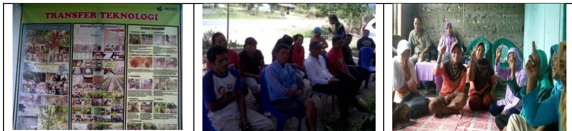
Figure 1. Media and Group Meeting

Forms of media training Kakao by MARS. MARS works with provincial policy. Although the implementation is determined by the district, such as Space School's training is given to a village, but actually the training is e combined into 1 of 3 time countryside.