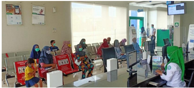
Figure 1. Frontliner Staff Direct Communication.

Figure 1 above is a direct communication by the BPJS Kesehatan Solok branch in providing information or handling participant complaints. Participants can request information or submit complaints by waiting for the queue to be handled by the frontline staff.