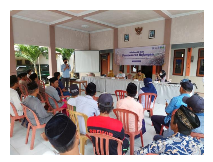
Figure 1. Crab Enlargement Training.

The crab enlagement technique that will be carried out is in the form of a location or cage with walls made of nets supported by wooden stakes, while the bottom of the cage is in the form of a water base, which can be called pen culture (Effendi, 2004). In this enlargement trial, we did not use a waterwheel, but we simply used the tides to replace the water in the location. The crab enlagement techniques that have been carried out are as follows,