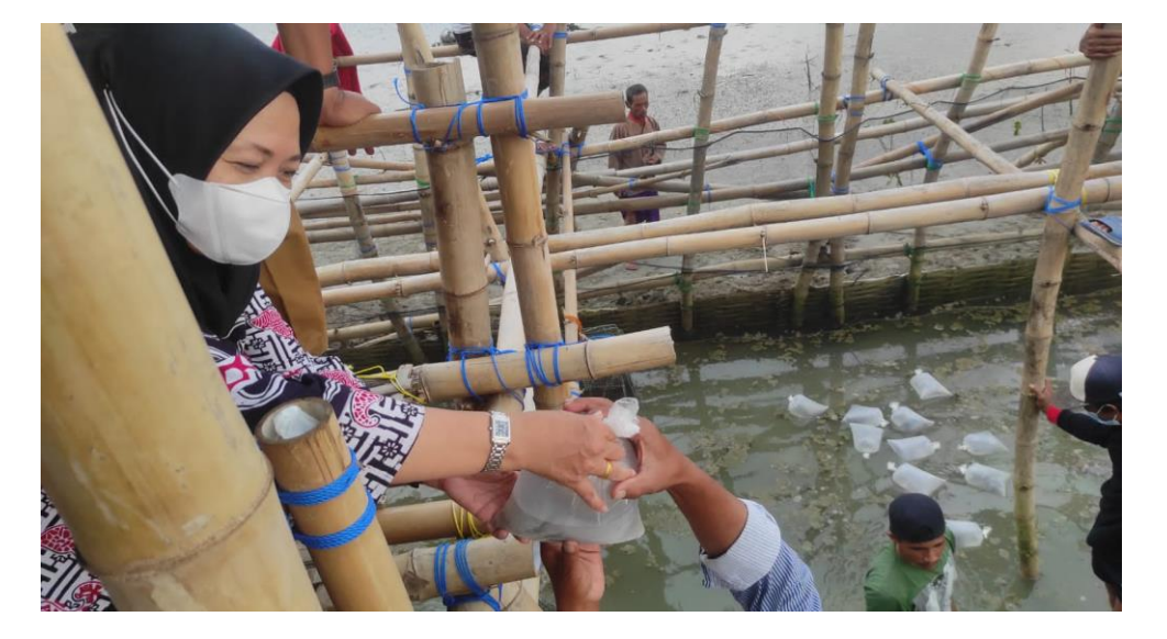
Figure 3. Distribution of Crab Seeds.

According to (Setiyowati & Retna, 2018), a cultivation system that has a low density of 0.1 fish per square meter unit (m^2) does not need to require feeding because the crab can live by relying on the presence of natural food contained in the system. However, to stimulate the growth of small crabs, it is necessary to give them additional feed from the outside in the form of trash fish (small fish that have been processed by drying). Feeding in Pagagan Village is given 2-3 times a day (Figure 4). Feeding management during the crab enlargement process must be adjusted according to portions. The feed dose is 100% up to 10% of the biomass weight. The dose of feed is given following the recommendations of Brackish Cultivation Water Cultivation Fishery Center of Takalar.