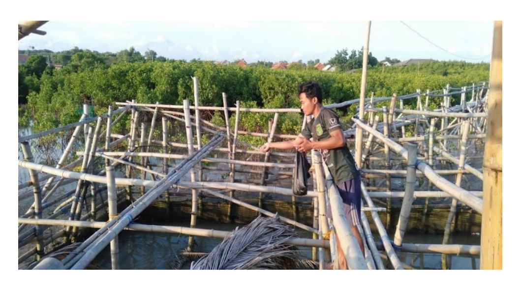
Figure 4. Feeding Process.