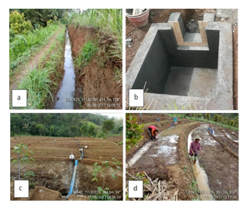
Figure 3. Water distribution through channels and the water level setting in the weir.

Upland rice is generally planted during the rainy season, but upland rice cultivation can be done in the dry season with irrigation water. Initially, the land was only produced once, but now it has been planted twice using the planting pattern of rice-rice-fallow. Tables 2 and 3 present an analysis of water balance to determine 100% crop water requirements. Irrigation in the vegetative stage required 24 mm of water each time with a 9-day interval. As much as 37 mm of irrigation was necessary during the generative phase with a 9-day interval, while in the ripening stage, it was necessary to irrigate 49 mm with a 16-day interval. The irrigation was halted one week to 10 days before harvest. The duration of watering was determined by the volume of water required for each irrigation treatment, which was 70, 85, and 100% of the crop water requirement and the water level in the weir.