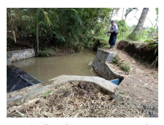
Figure 2. Channel reservoir as a source of irrigation in upland rice cultivation.