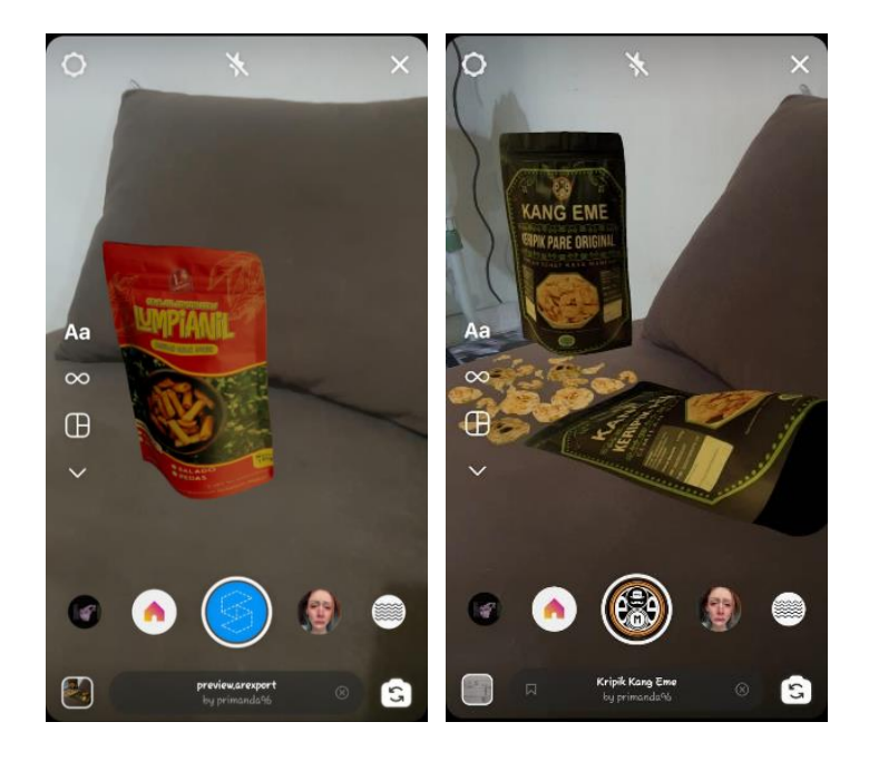
Figure 3. Augmented Reality Concept in Product Packaging

The workshop on the use of Augmented Reality technology based on social media is given by a team from the D3 Software Engineering study program, Faculty of Applied Sciences. This training is given to all participants to provide knowledge and additional promotion methods using AR technology on social media, especially Instagram. Participants are given an overview of AR technology, applications that can be used to create AR-based promotional content, and participants practice on their respective gadgets to create promotional content on Instagram through stories or posts that raise their brand using AR technology.