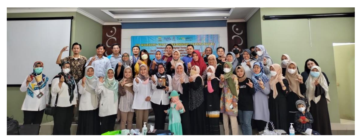
Figure 2. Workshop Implementation for Batununggal Co-working Space

Digital tools and digital advertising training is provided by the D3 Digital Marketing study program team, Faculty of Applied Sciences. This training is given to MSME actors and residents of Batununggal District who will build a start-up business. This training is needed by partners to add insight and skills in the use of digital media and the use of advertising in digital media to support the marketing activities of their products. The results obtained from the digital tools and digital ads training activities have increased the competence of the target partners in terms of using digital media in marketing and promoting the products they offer. In addition, MSME actors who are members of the Batununggal Bandung co-working space can implement their marketing strategies using various digital tools using Search Engine Marketing (SEM) and Social Media Marketing (SMM). Participants are also given an overview of the platforms that can be used in Social Media Advertising, namely Facebook Ads, Instagram Ads, Twitter Ads and TikTok Ads.