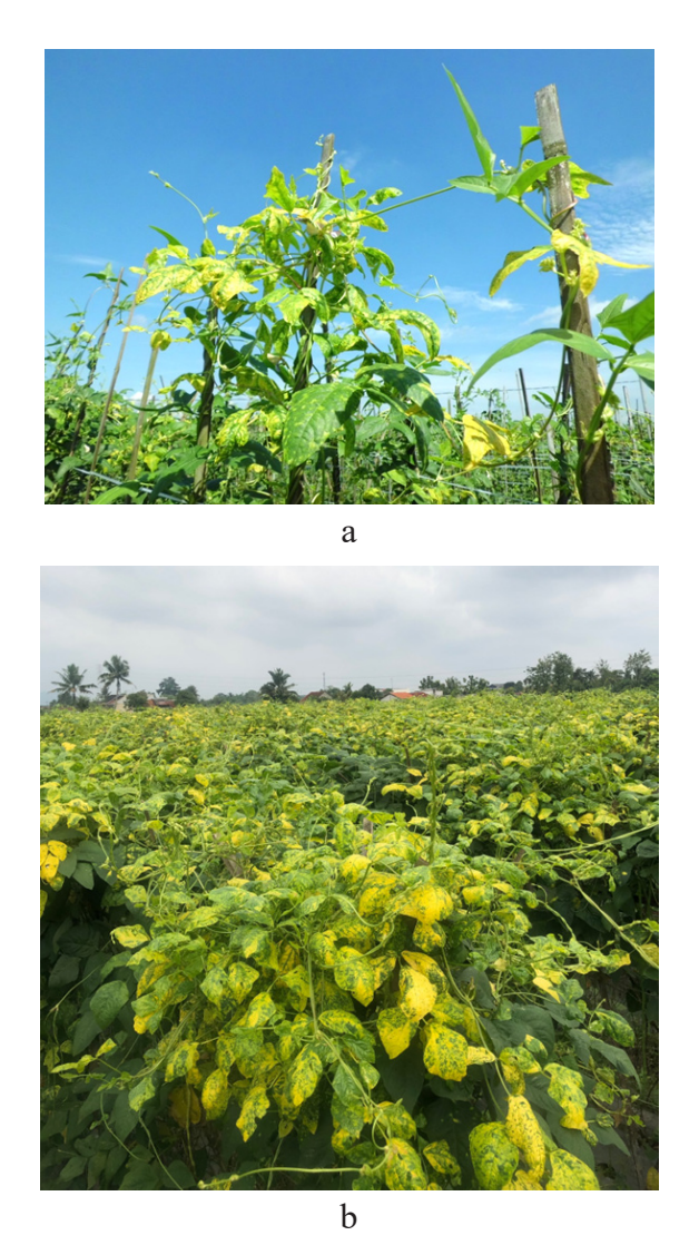
Figure 1 Yellow mosaic disease on yard long bean in Bogor after one decade. a, 2012 and b, 2022.

the spread of yellow mosaic disease of yard long bean using routine detection assay, it is necessary to develop specific detection method for MYMIV. Therefore, the aim of this study is to design specific primer for detection of MYMIV, especially for Indonesian isolates.