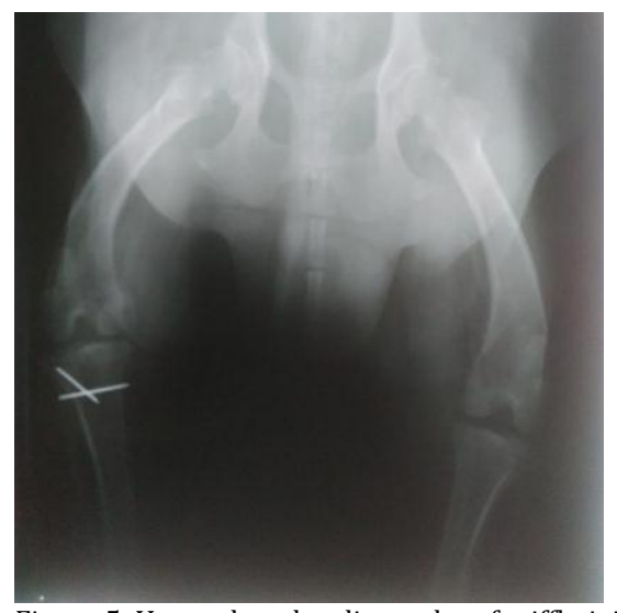
Figure 5. Ventrodorsal radiography of stiffle joint after surgery

Radiographs examination was done postsurgery to confirm the position of patella. Based on the radiograph result, the patella was in place.