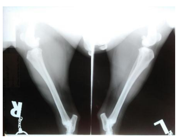
Figure 1. Ventrodorsal radiography of right stiffle joint

Physical examination. Gait were observed on physical examination of the hind legs with walking and doing flexor and extension was found disorder in joints and revealed that patellar was not in the trochlear sulcus permanently, tend to be medial, and could not be back to the trochlear sulcus by itself.