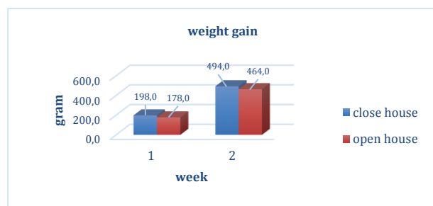
Figure 2. Weight gain of Broiler

House Type Comparison to Weight Gain. The weight gain of broiler can be seen in Figure 2.