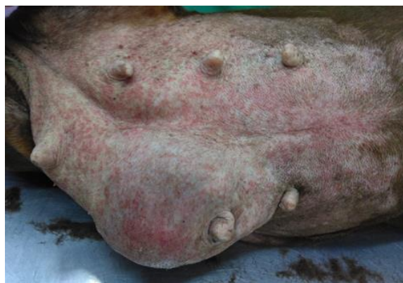
Figure 1. Gross findings during the physical examination. The patient exhibited had mammary mass in the left caudal mammary gland (13.5 cm × 7.6 cm in size).

An 8y old female Dachshund Miniature Dog named Casey came to Teaching Animal Hospital University of Brawijaya, May 2018, with a large ventrocaudal adominal mammary mass. She was anorexic, and depressed, no vaccination history, never mated, last wormed April 2018. Results of the physical examination were, weight 11.5 kg, temperature 39,7 C, HR 120/minute, RR 48/minute, CRT <2 sec. There were visible lumps on the left mammary glands of the three nipples from caudal and petechia around the abdomen (Fig. 1). Palpation of affected mammary glands found several hard nodules within the glands. These areas were further investigated by performing FNA's, and cytology. Also CBC, and blood chemistry were performed.