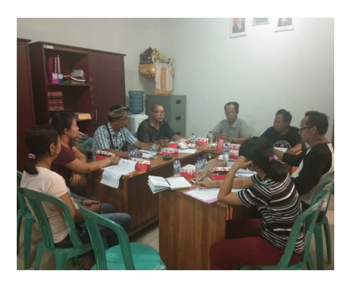
Figure 3. Operational management evaluation meeting with the advisor and supervisory board of VOE Wija Sari In Samsam Village